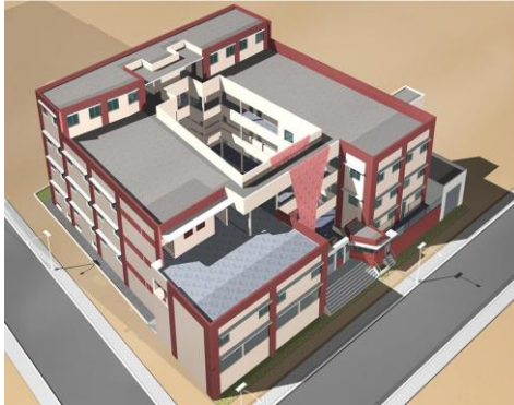
Construction of a school in Mamelles / Dakar :