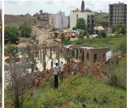
Realization of Palazzo Tower in Ave. Cheikh Anta Diop / Dakar :